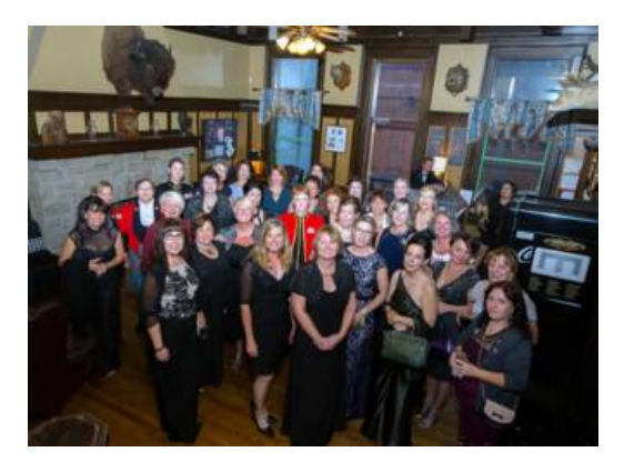
The 2017 Jean Armour Lassies