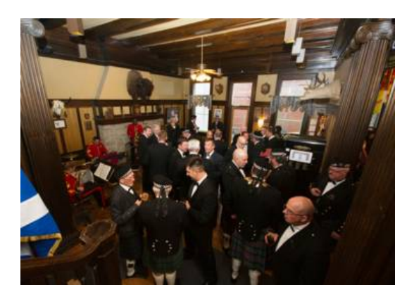
Cocktail hour at the Cypress Club

The Calgary Burns Club singers were also present who proudly gave their all and sang and danced unto the wee hours. Further, there was Club piper Mal-