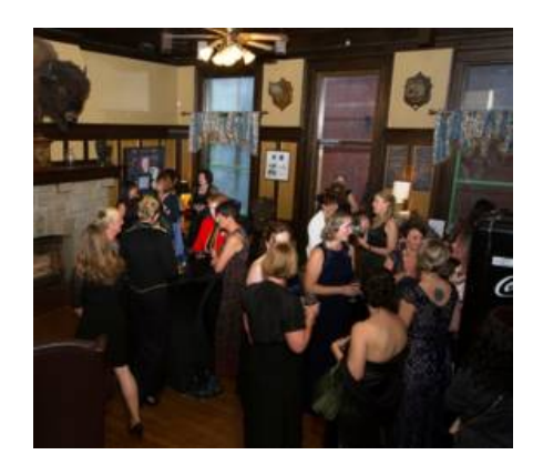
The ladies mingle before dinner