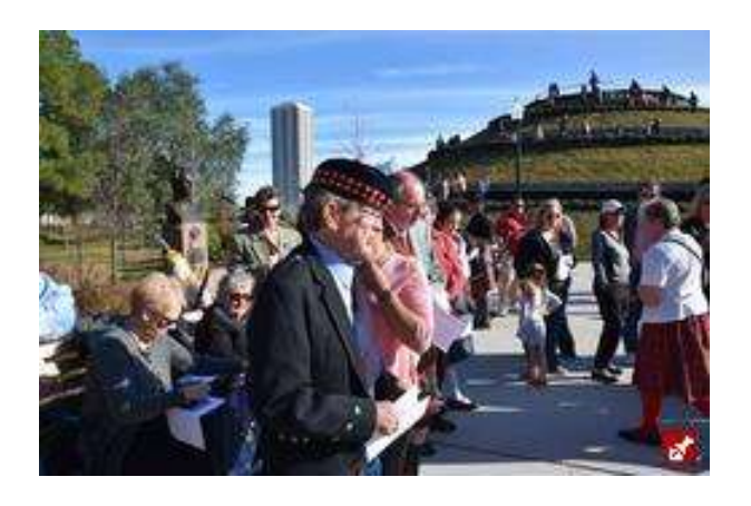
The spiral walkway