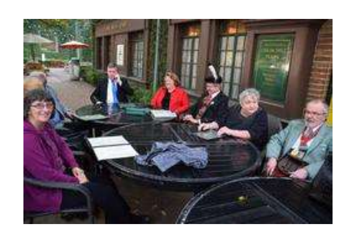
Gathering at the pub