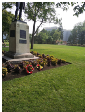
The two wreaths (one on behalf of RBANA one on behalf of the club) at the base of the statue.